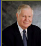
Dr. Henry Blackaby

Bayside Baptist-Harrison Brainerd Baptist-Chattanooga Candies Creek Baptist-Cleveland First Baptist - Cleveland Westwood Baptist - Cleveland