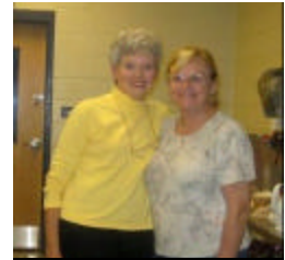
THANKS to Bobby's Volunteers

Servers were volunteer youth from our local churches, and did a wonderful job attending the tables.