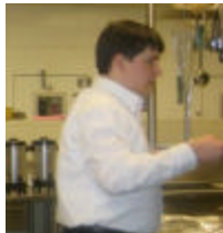
The YOUTH did a great job!